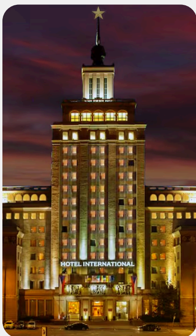
Grand Hotel International