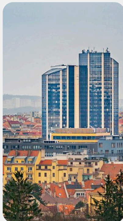
Grand Hotel Prague Towers