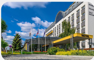
Wellness Hotel Step