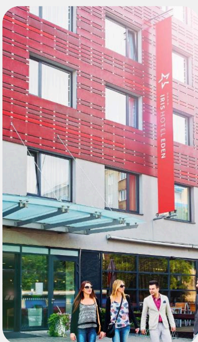
Iris Hotel Eden