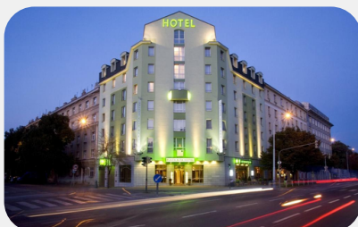
Plaza Alta Prague